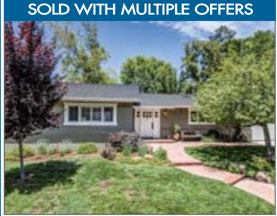
3106 Sandalwood Court, Lafayette 3BD/2.5BA, 2,159+/- sq. ft. home Offered at $1,525,000 3106SandalwoodCourt.com

Share your thoughts, insights and opinions with your community. Send a letter to the editor: letters@lamorindaweekly.com