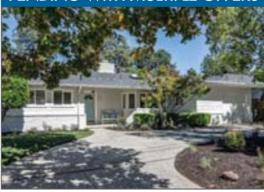
862 Birdhaven Court, Lafayette 4BD/2BA, 1,986+/- sq. ft. home Offered at $1,395,000 862BirdhavenCourt.com