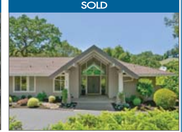
699 Old Jonas Hill Road, Lafayette 4BD/2.5BA, 2,745+/- sq. ft. home Offered at $1,895,000 Represented Buyers